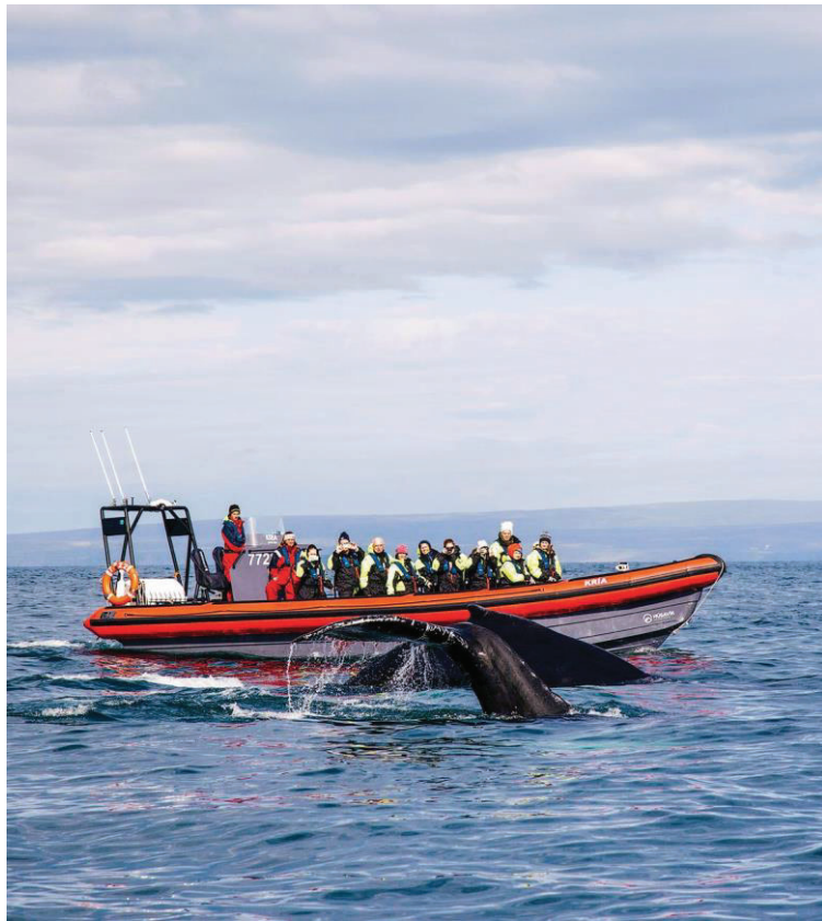
Small Group Travel rewards travelers with new perspectives. With just 12-24 passengers, these are the personal adventures that today's cultural explorers dream of.

10 Days • 15 Meals: 8 Breakfasts, 1 Lunch, 6 Dinners