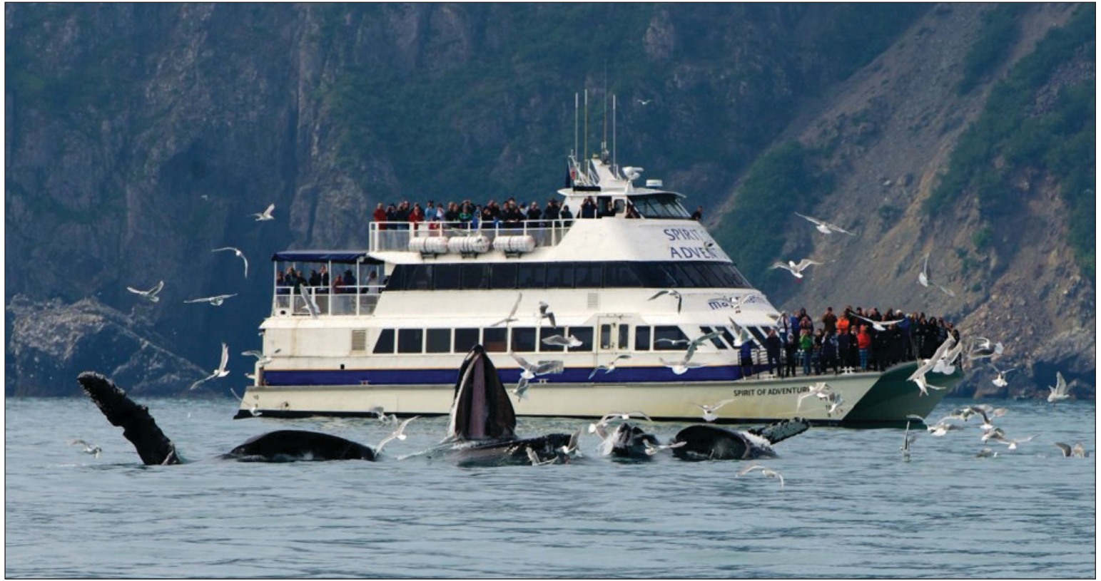
PREMIER WORLD DISCOVERY

We'll spend two nights in Denali State Park and on the second morning will venture deep into the park to see the wild animals on a 5-hour Tundra Wilderness