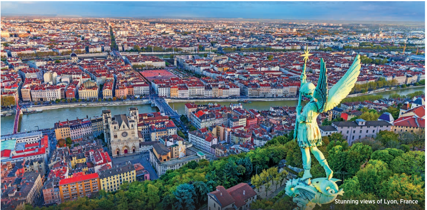
Stunning views of Lyon, France