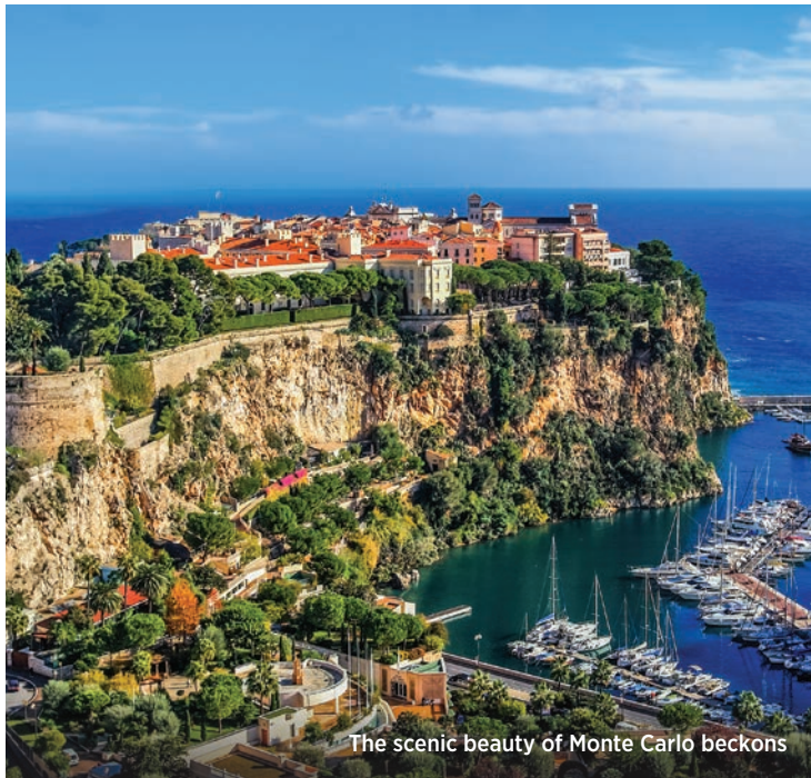
The scenic beauty of Monte Carlo beckons

This evening you are invited to join the unique experience of a classical concert in Avignon. Meals: B, L, D