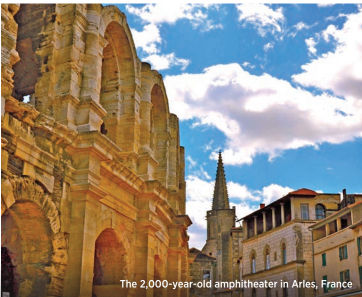
The 2,000-year-old amphitheater in Arles, France

France's third-largest city, Lyon, is a former Roman capital, steeped in history and considered to be the gastronomic heartbeat of the country. Home to traditional Lyonnaise cuisine, you'll enjoy an array of exemplary culinary delights. Today, a guided city tour awaits you, including a visit to the UNESCO World Heritage-listed Basilica Notre-Dame de Fourvière, part of the inscribed historic site of Lyon.