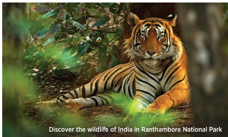
Discover the wildlife of India in Ranthambore National Park

Begin the day with a tour of Old Delhi, a labyrinth of narrow lanes overflowing with major attractions and World Heritage Sites. See Raj Ghat, the memorial site of Mahatma Gandhi, sitting serenely on the banks of the Yamuna River.