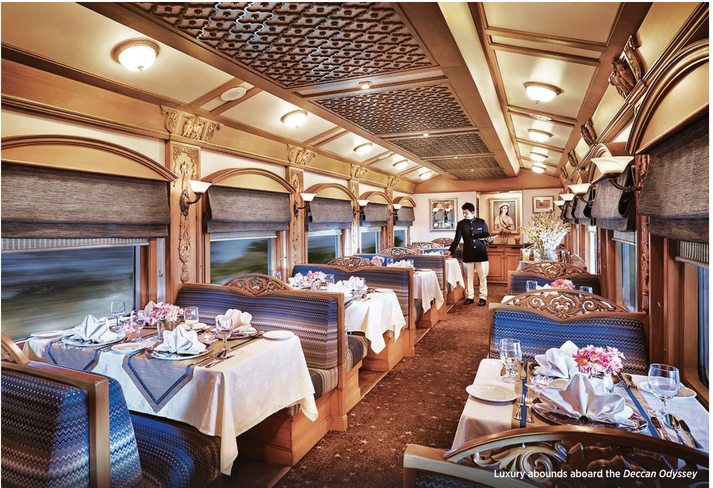
Luxury abounds aboard the Deccan Odyssey