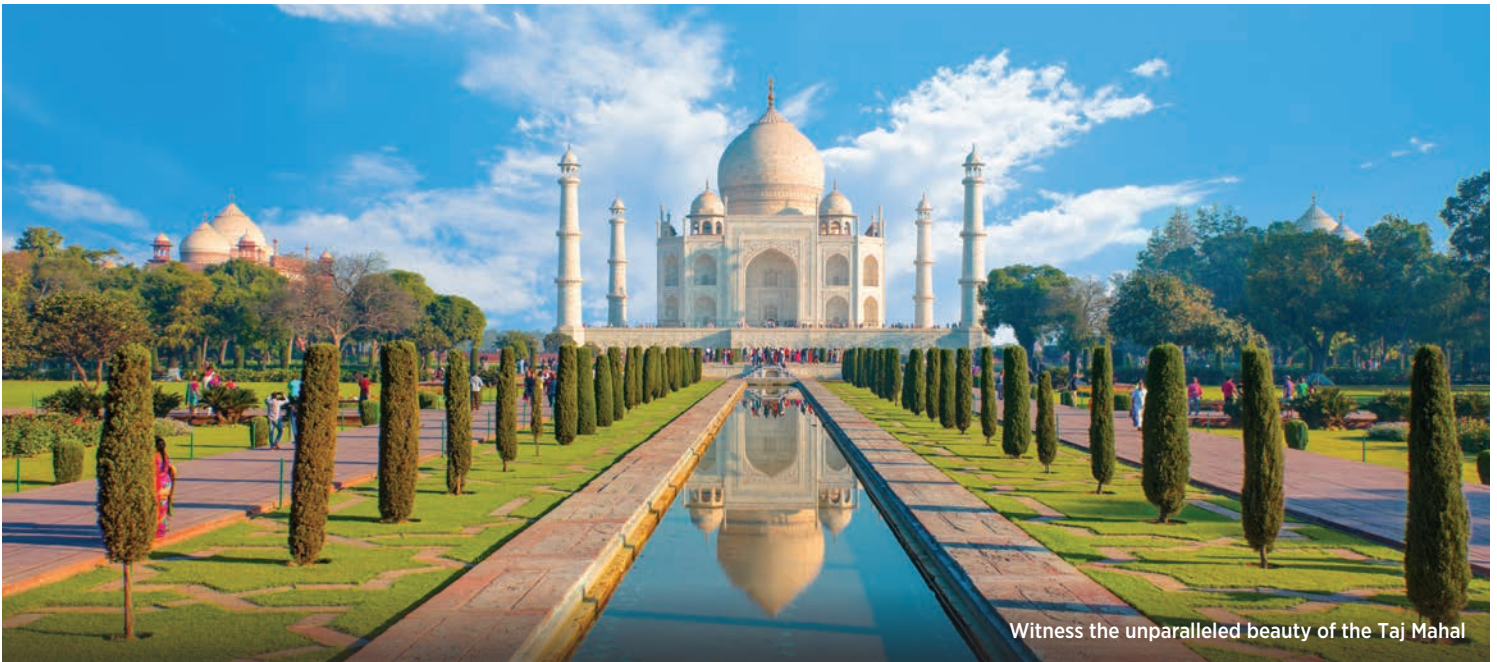
Witness the unparalleled beauty of the Taj Mahal