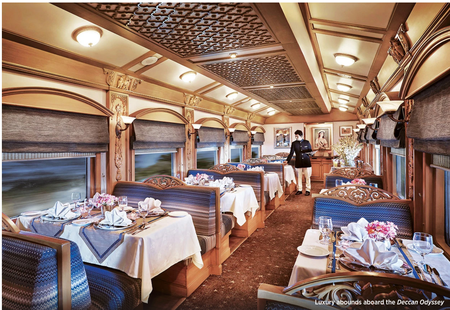
Luxury abounds aboard the Deccan Odyssey