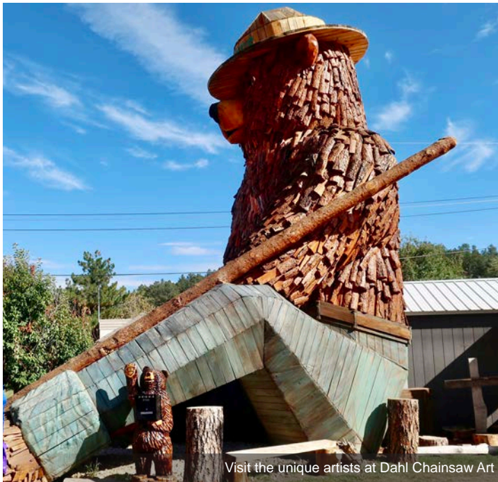
Visit the unique artists at Dahl Chainsaw Art

an on own lunch. Then, a local guide takes you through Badlands National Park, a uniquely beautiful geologic area formed over millions of years by wind, rain and erosion. Return to Rapid City for a farewell dinner featuring the entertainment of an Indian dancer, storyteller and flute player. Meals: B, D