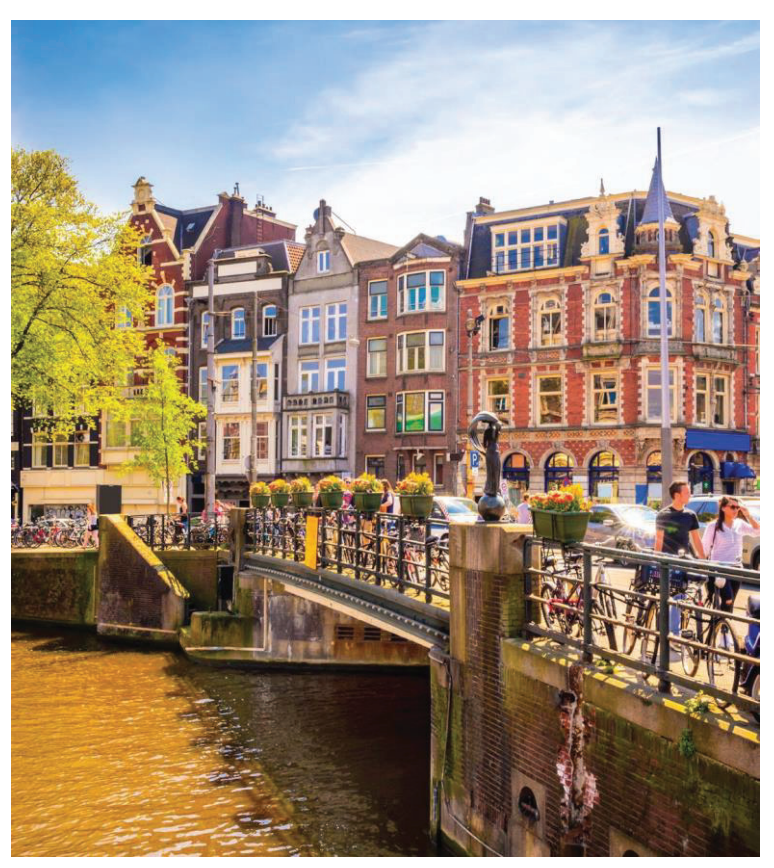
14 Days • 18 Meals: 12 Breakfasts, 6 Dinners

HIGHLIGHTS... Amsterdam, Canal Cruise, Lier, Choice on Tour: Brussels Historic Tour or Comic Book Route, Luxembourg, Strasbourg, Basel, Mercedes-Benz Museum, Münich, Salzburg, Vienna, Choice on Tour: Belvedere Museum or Kunsthistorisches Museum