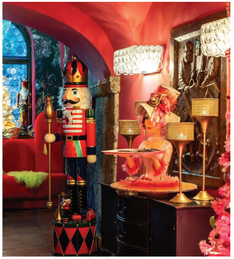
8 Days • 10 Meals: 6 Breakfasts, 1 Lunch, 3 Dinners

HIGHLIGHTS... Innsbruck, Choice on Tour: Innsbruck City Tour or Museum of Tyrolean Heritage, Seefeld, Carriage Ride, Salzburg, St. Peter's Restaurant, Linderhof Palace, Oberammergau, Munich, Christmas Markets