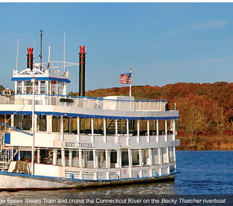
Essex Steam Train and cruise the Connecticut River on the Becky Thatcher riverboat

DAY 8 Plymouth Rock and Whale Watching Cruise: Today pass through the state of Rhode Island, famous for its maritime history. In Plymouth, Massachusetts climb aboard your sea going vessel for a whale watching excursion. This naturalist guide-led cruise sails out to Cape Cod Bay and Stellwagen Bank, a marine sanctuary and primary feeding ground for Humpback, Finback, Minke and the endangered Right Whales. Pay a visit to Plymouth Rock where our forefathers first settled on American soil. Tonight, gather for a farewell dinner hosted by your Tour Manager. Meals: B, D