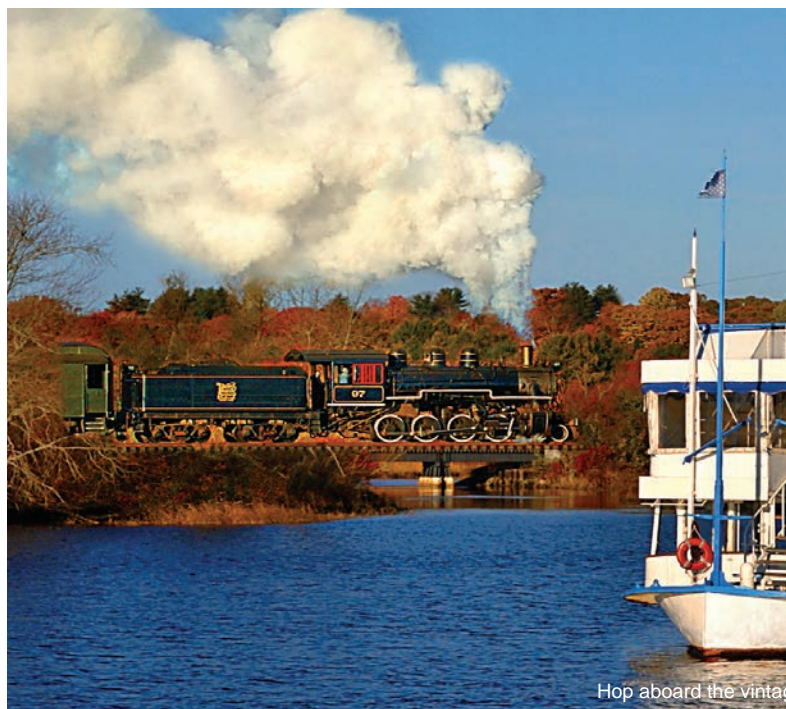
Hop aboard the vintage

DAY 1 Arrive in Boston: Arrive in Boston, Massachusetts with an included transfer to your hotel. Meet your Tour Manager in the hotel lobby at 6:00 p.m. for a welcome dinner. Meal: D