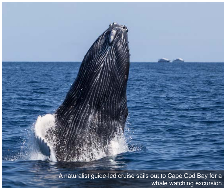
A naturalist guide-led cruise sails out to Cape Cod Bay for a whale watching excursion

DAY 9 Travel Home: This morning, take the group transfer to Boston's Logan Airport for flights out after 12:00 p.m. Meal: B