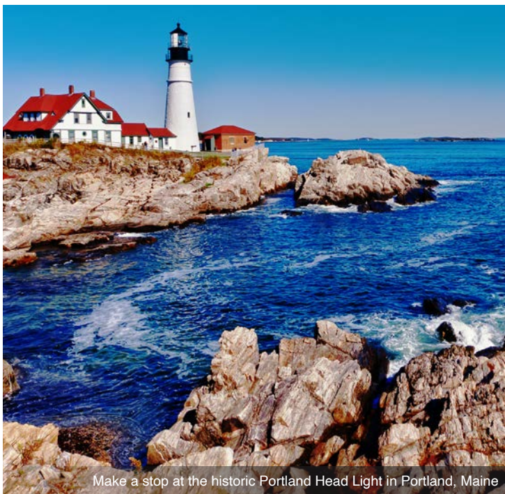
Make a stop at the historic Portland Head Light in Portland, Maine