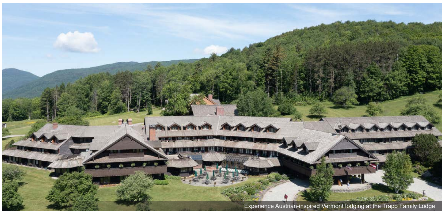
Experience Austrian-inspired Vermont lodging at the Trapp Family Lodge

and maybe even meet and greet with a Trapp Family member. Then, climb aboard your coach and head to the famous Ben & Jerry's Ice Cream for a tour and tasting of their delicious ice cream. Enjoy lunch and shopping on your own in the charming village of Stowe. In the afternoon you will come to Vermont Gentle Giants for an exciting sleigh ride (weather permitting of course). Return to the lodge to freshen up before dinner. Tonight, dinner is served in the Trapp Family Bierhall, featuring freshly brewed lagers and a delicious selection of foods with an Austrian flare. Meals: B, D