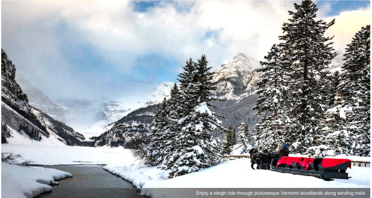
Enjoy a sleigh ride through picturesque Vermont woodlands along winding trails